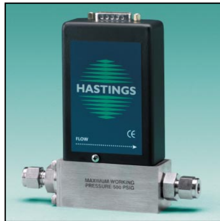
HFM-200 / HFC-202